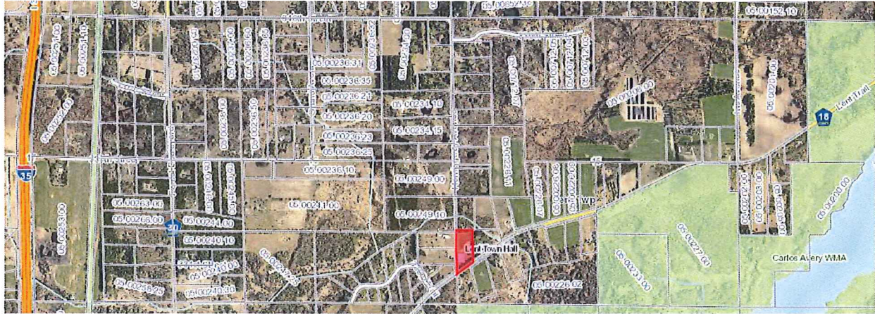
Lent Town Hall is highlighted in red